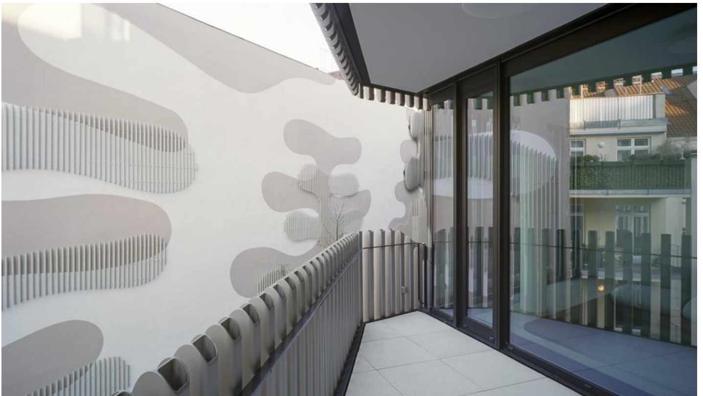
Apartmenthouse- Johannisstraße 3