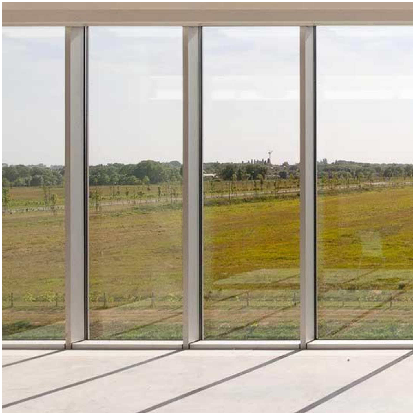
SGG COOL-LITE® XTREME 60/28 II