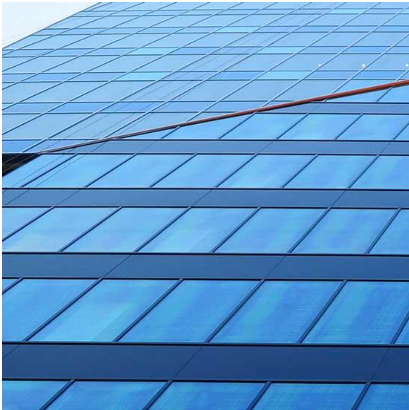
SGG COOL-LITE® SKN 154/154 II