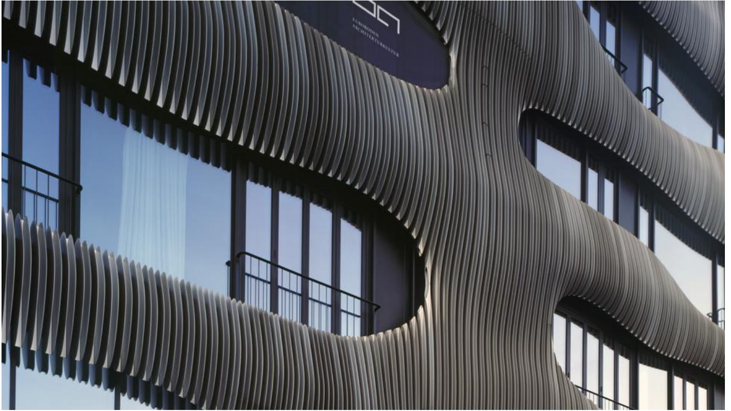
Apartmenthouse- Johannisstraße 3