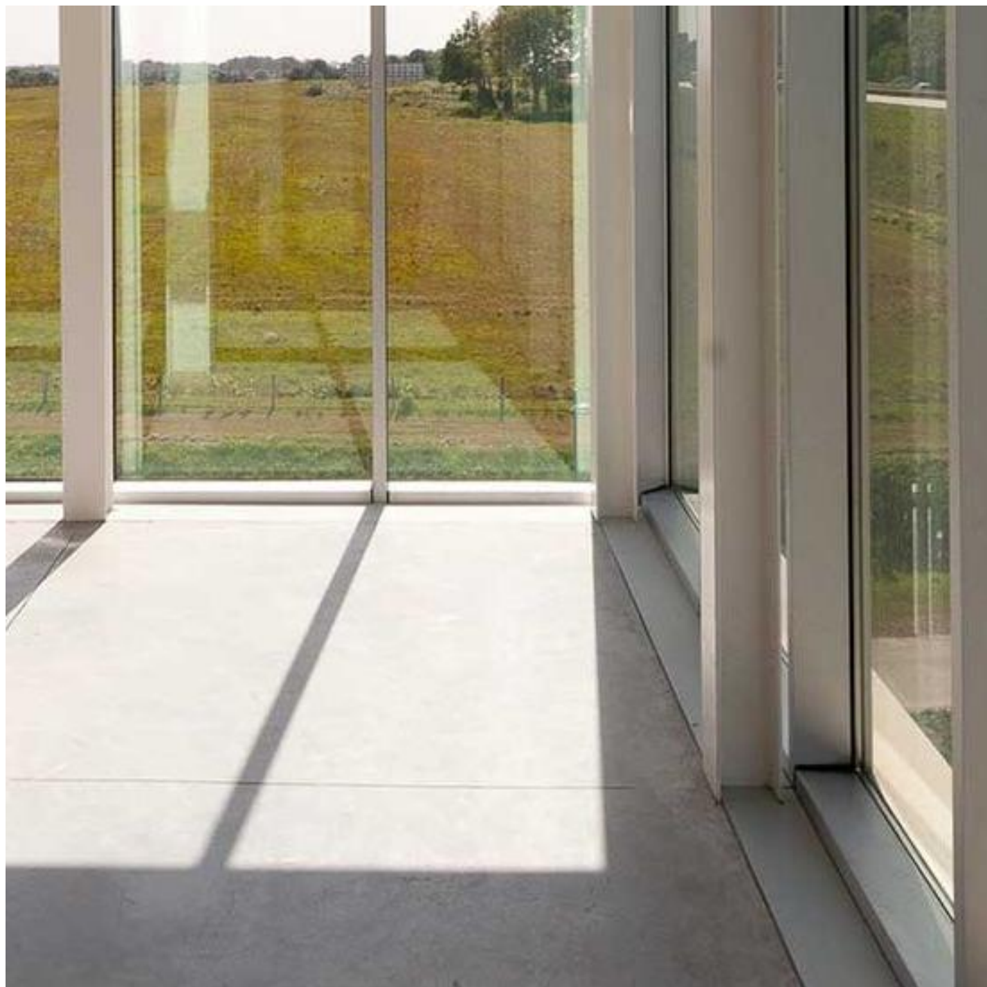
SGG COOL-LITE XTREME