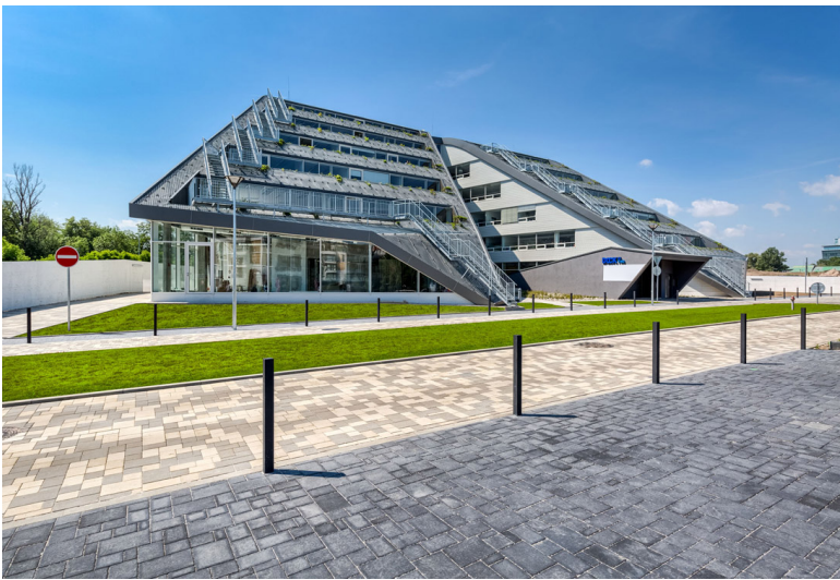
SAINT-GOBAIN CZECH REPUBLIC