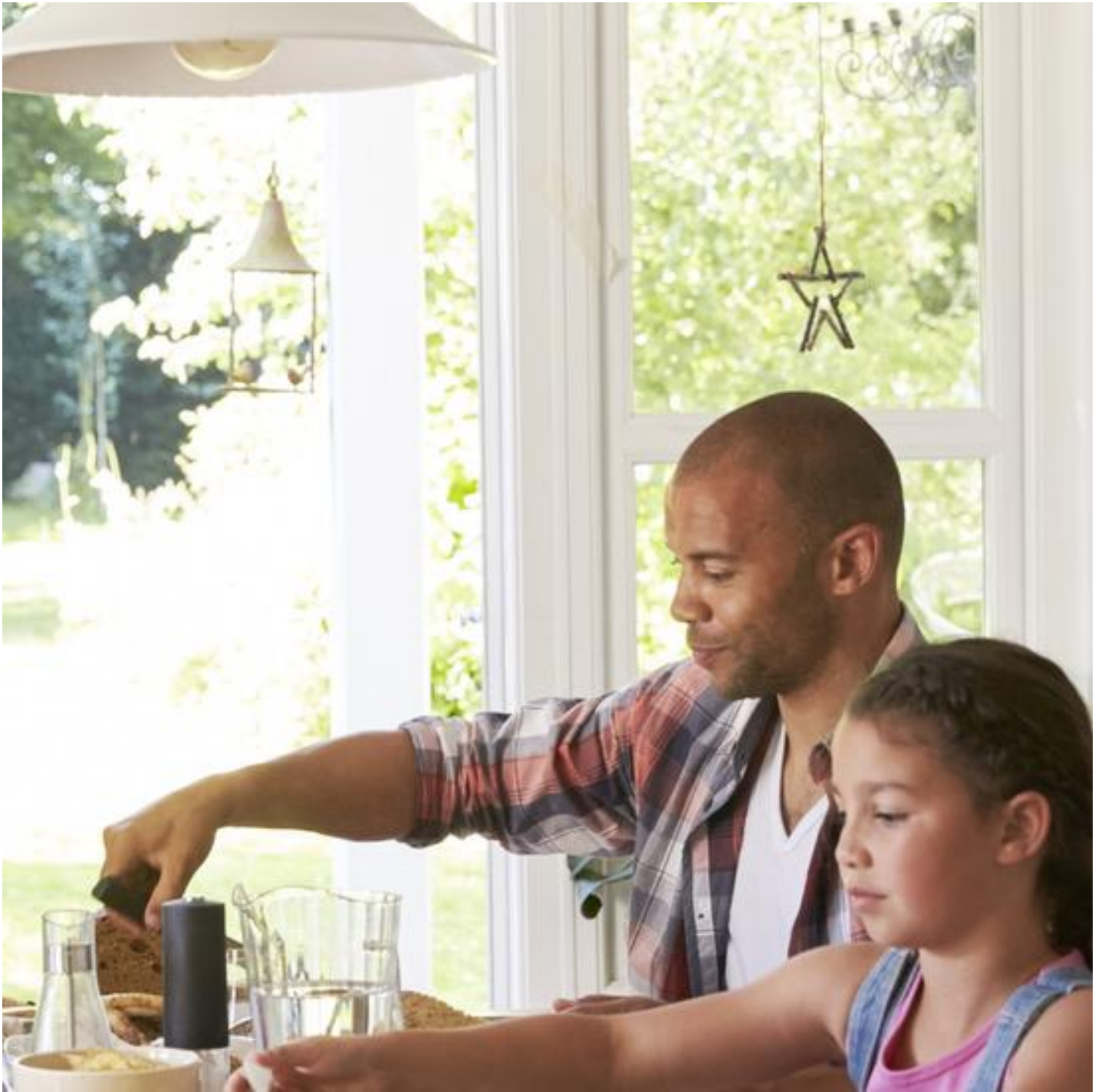
SGG PLANITHERM® TOTAL+