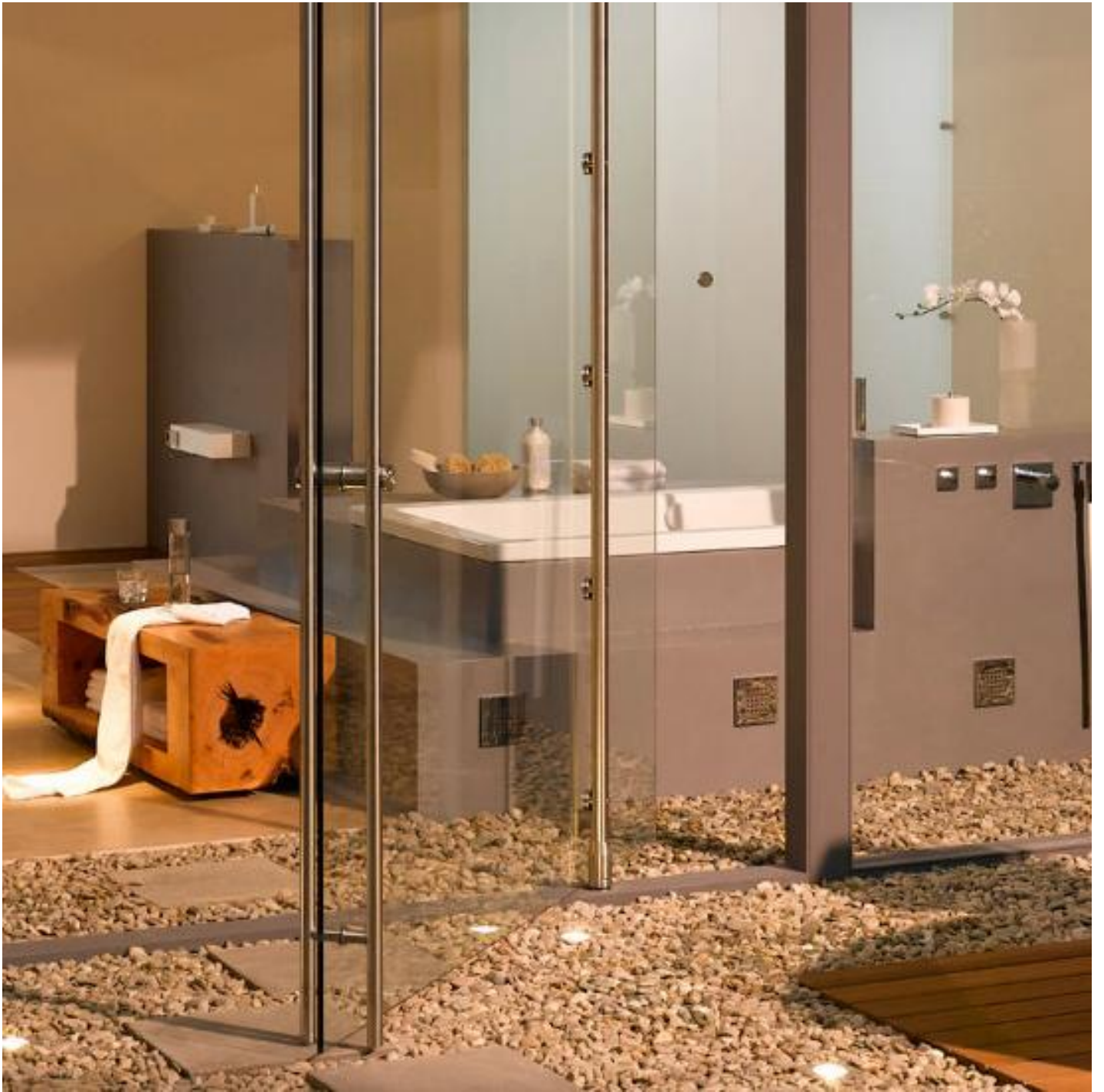
SGG PLANITHERM® 4S II