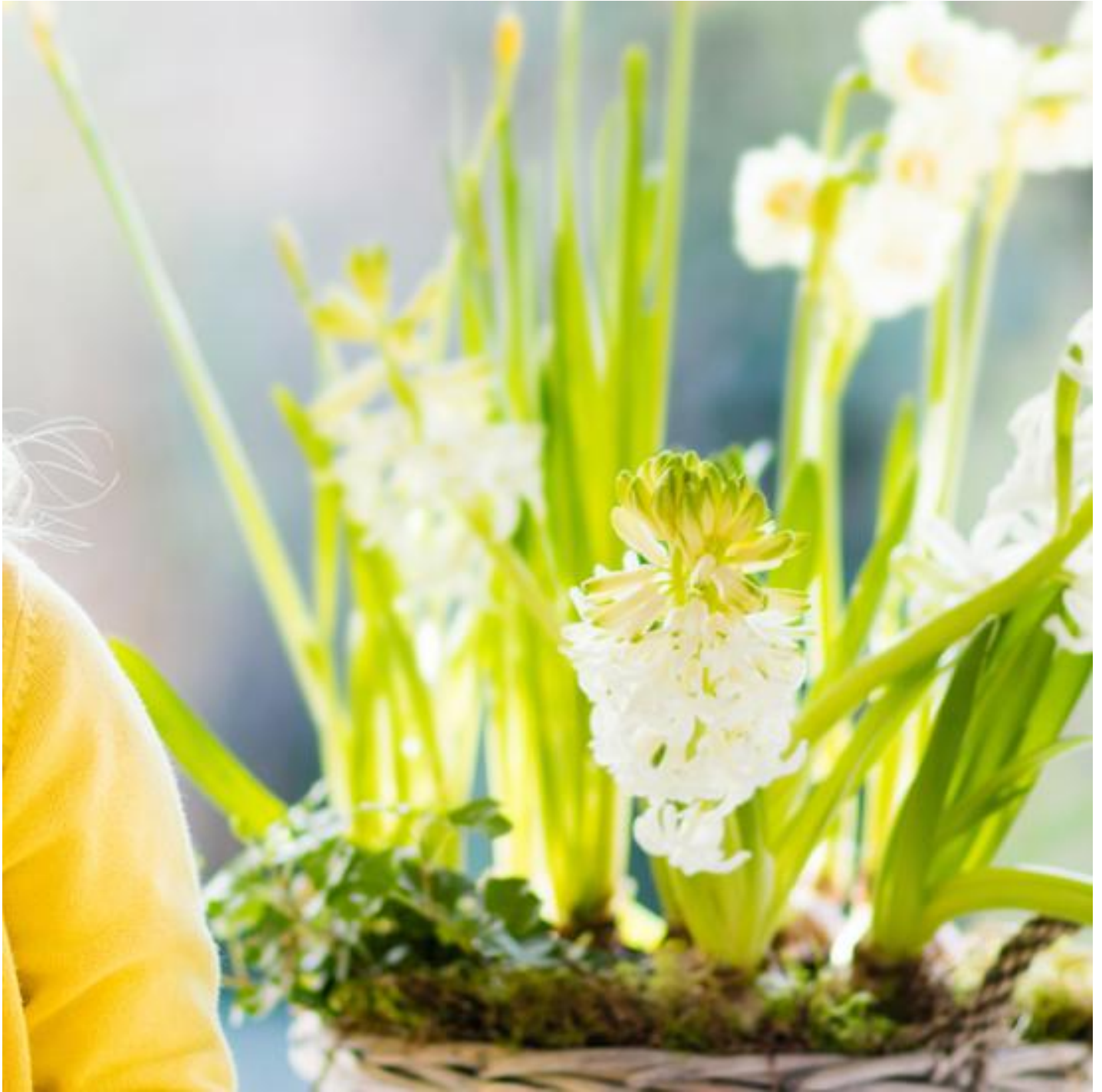
SGG PLANITHERM® ONE T