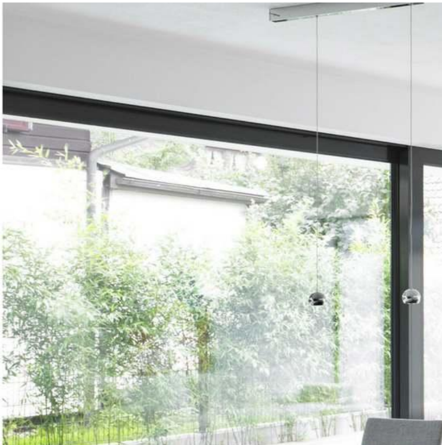
SGG PLANITHERM® FAMILY