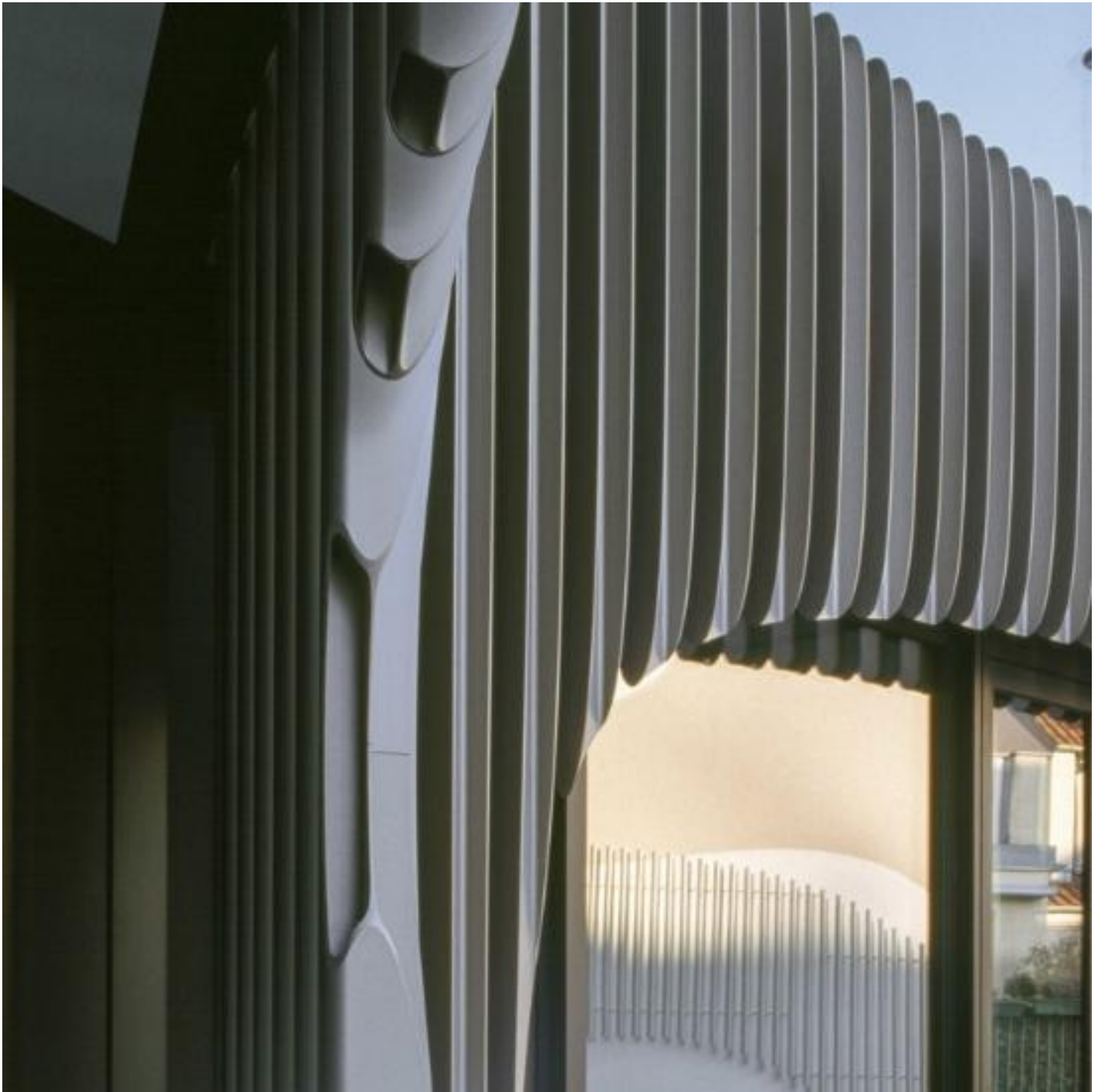
facades and curtain walling