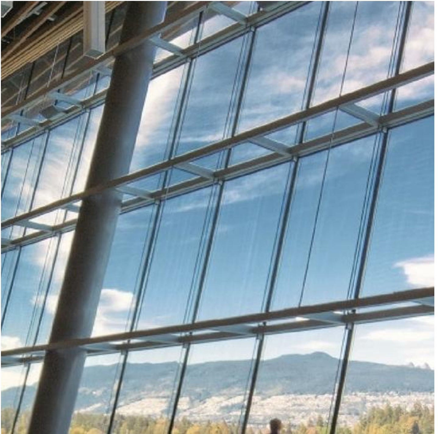
Build strong and aesthetic architectural façades with Saint-Gobain façade systems