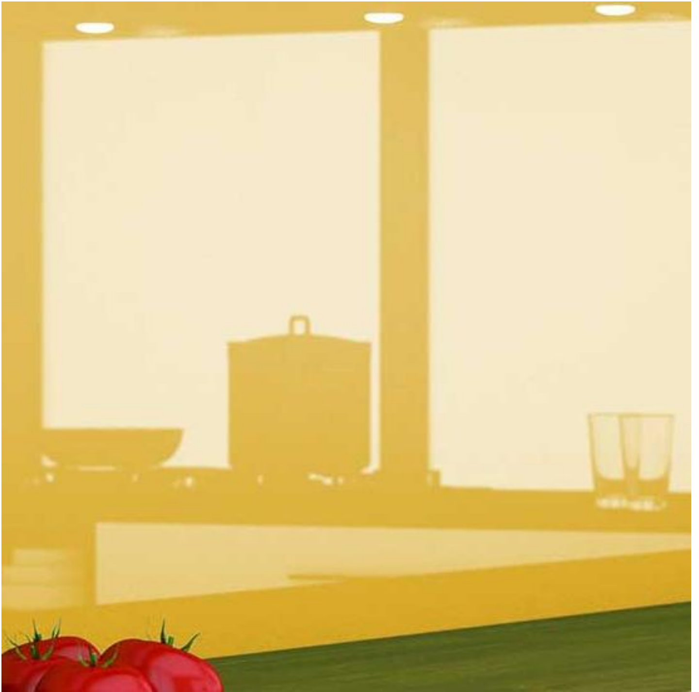
Lacquered glass SGG PLANILAQUE COLOR-IT