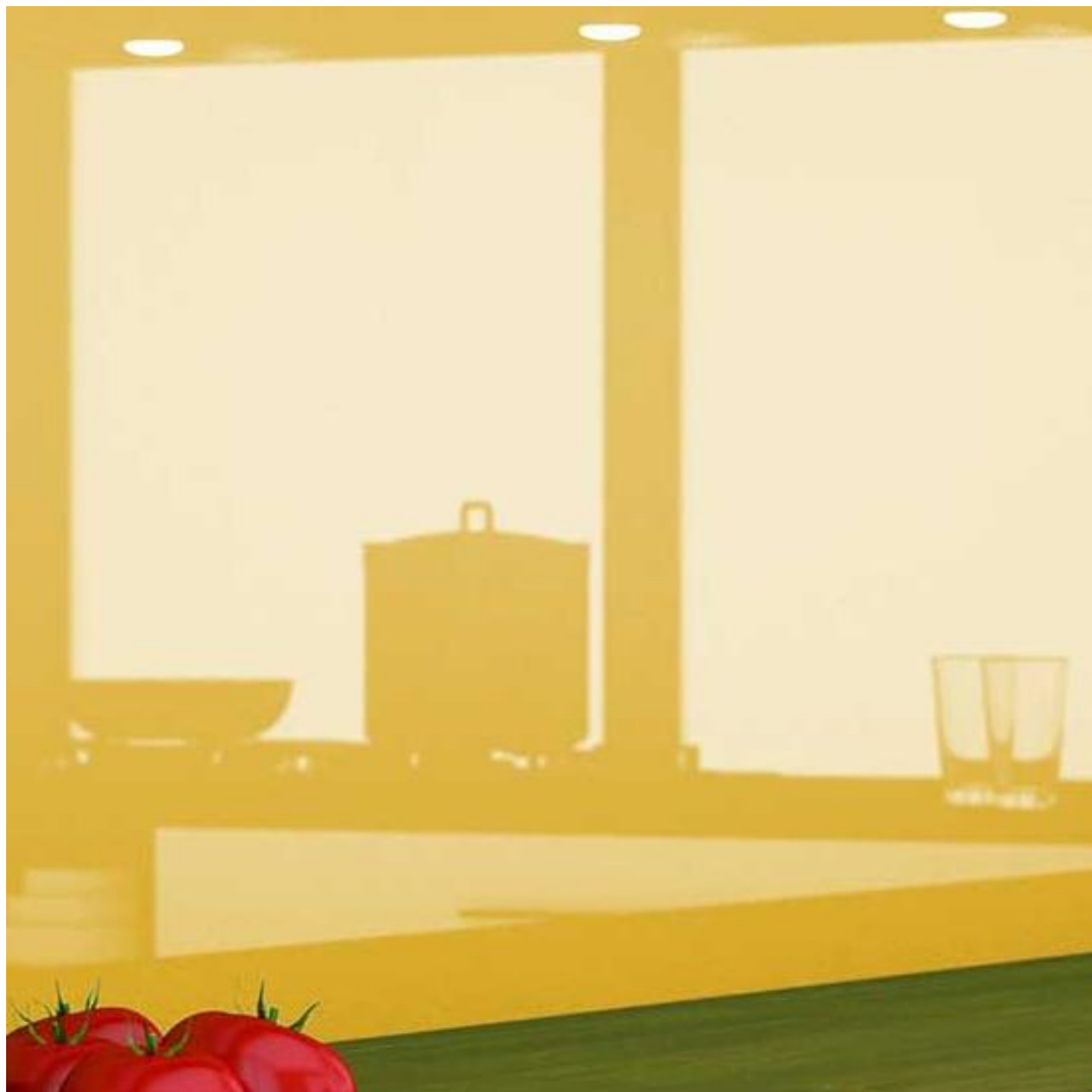
Lacquered glass SGG PLANILAQUE COLOR-IT