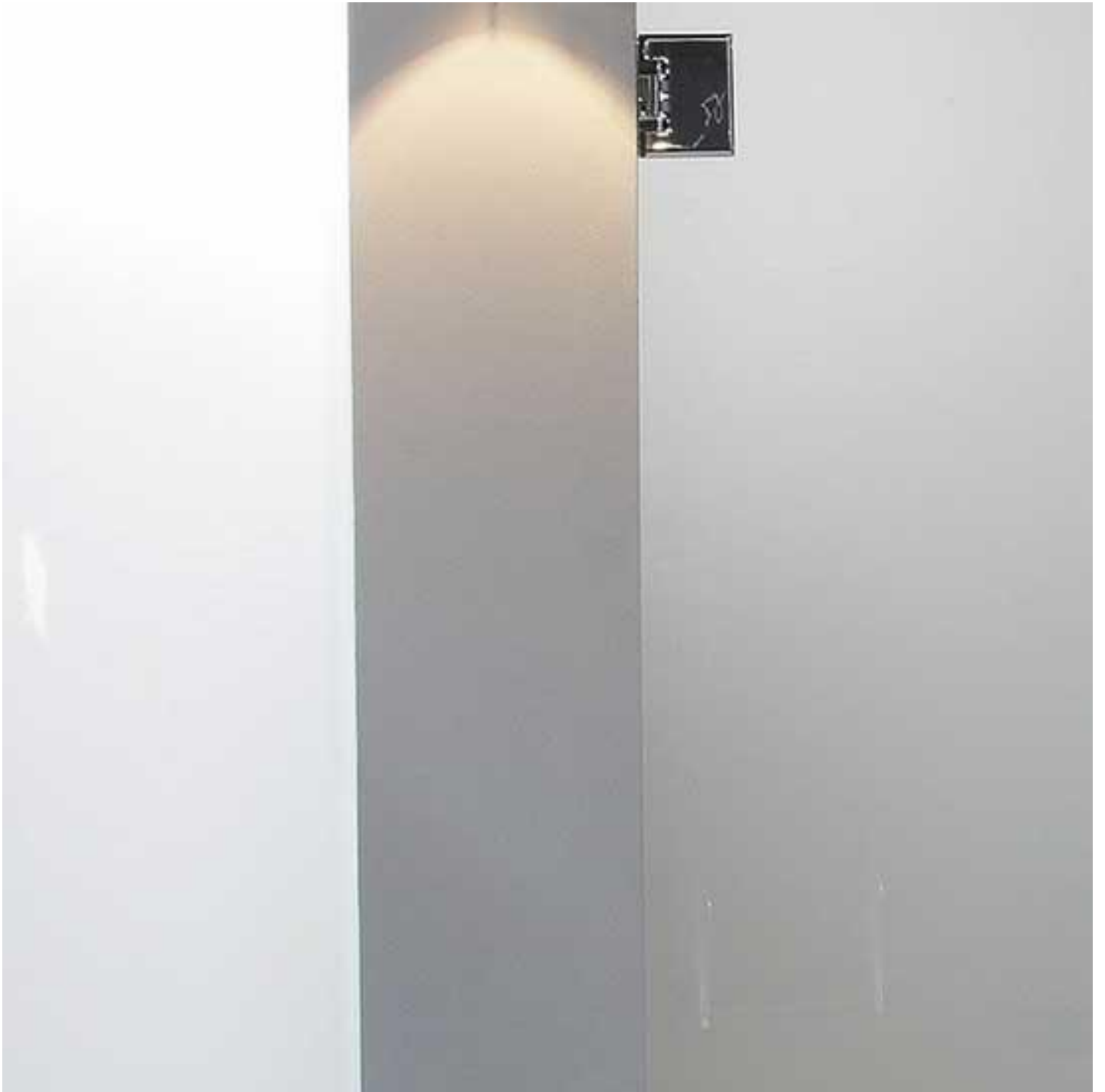
SGG SATINOVO® MATT