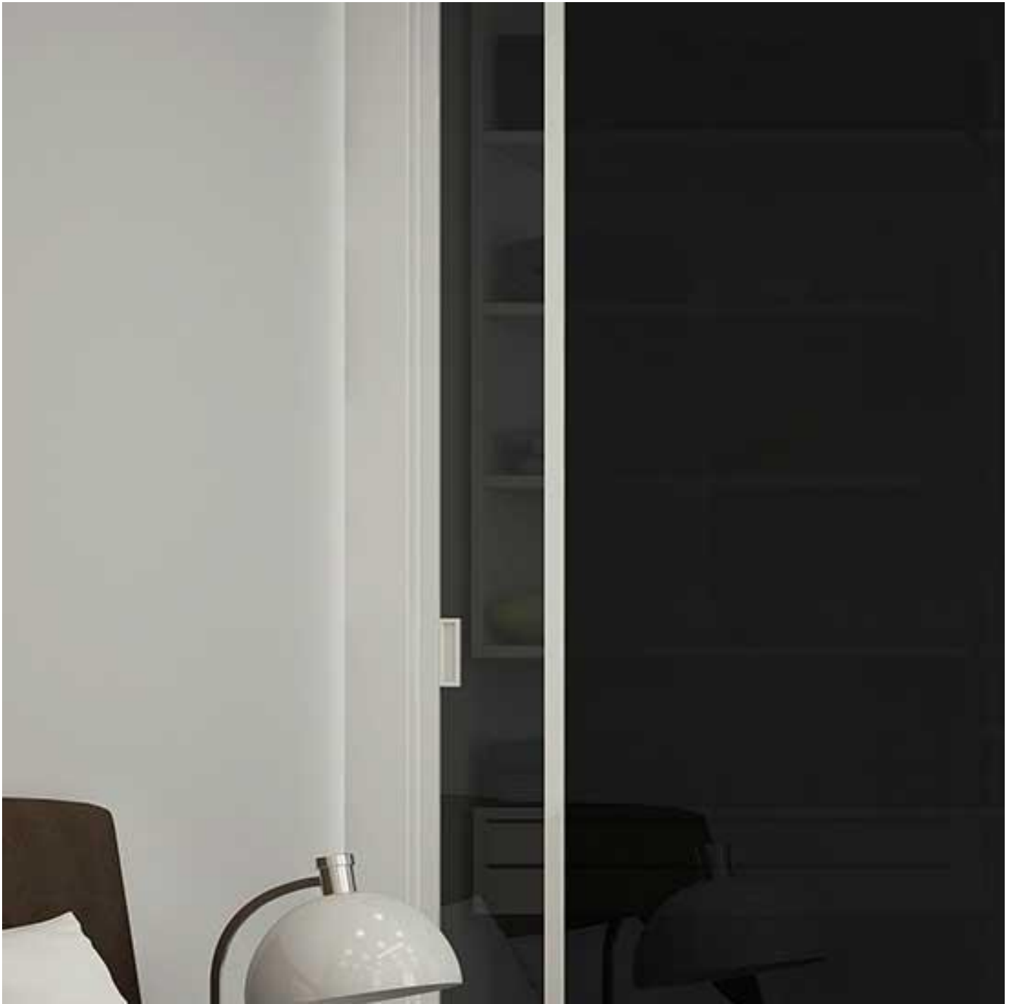
SGG PARSOL® ULTRA GREY