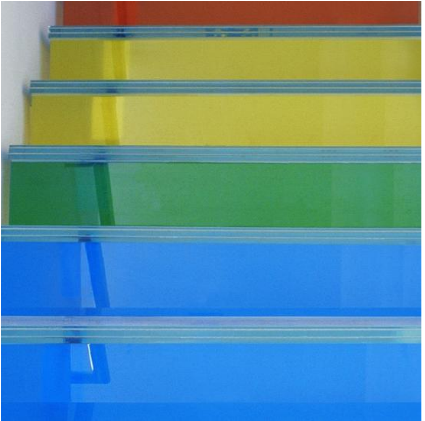
SGG STADIP COLOR®