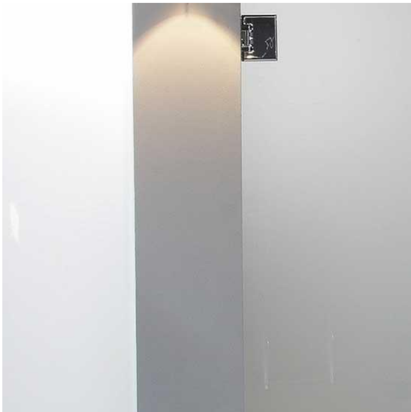
SGG SATINOVO® MATT