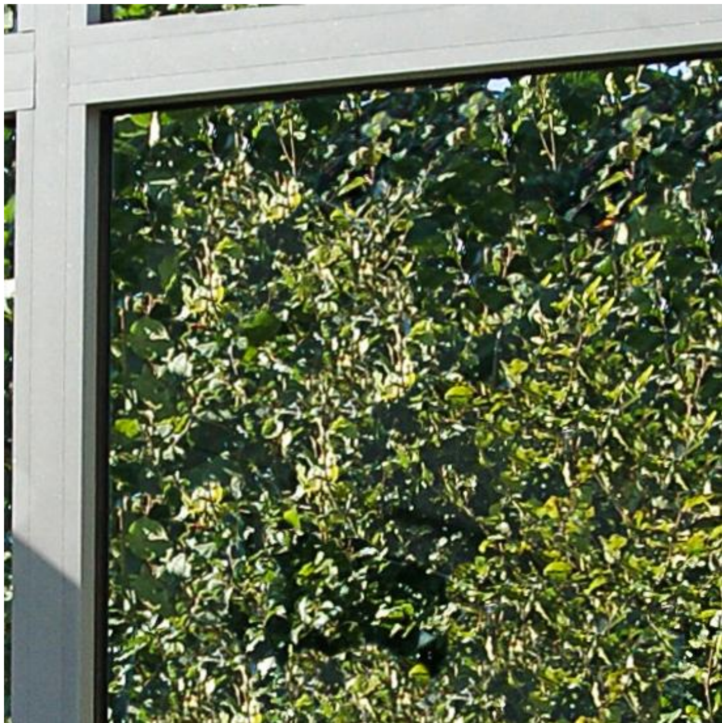
SGG BIOCLEAN® Natura