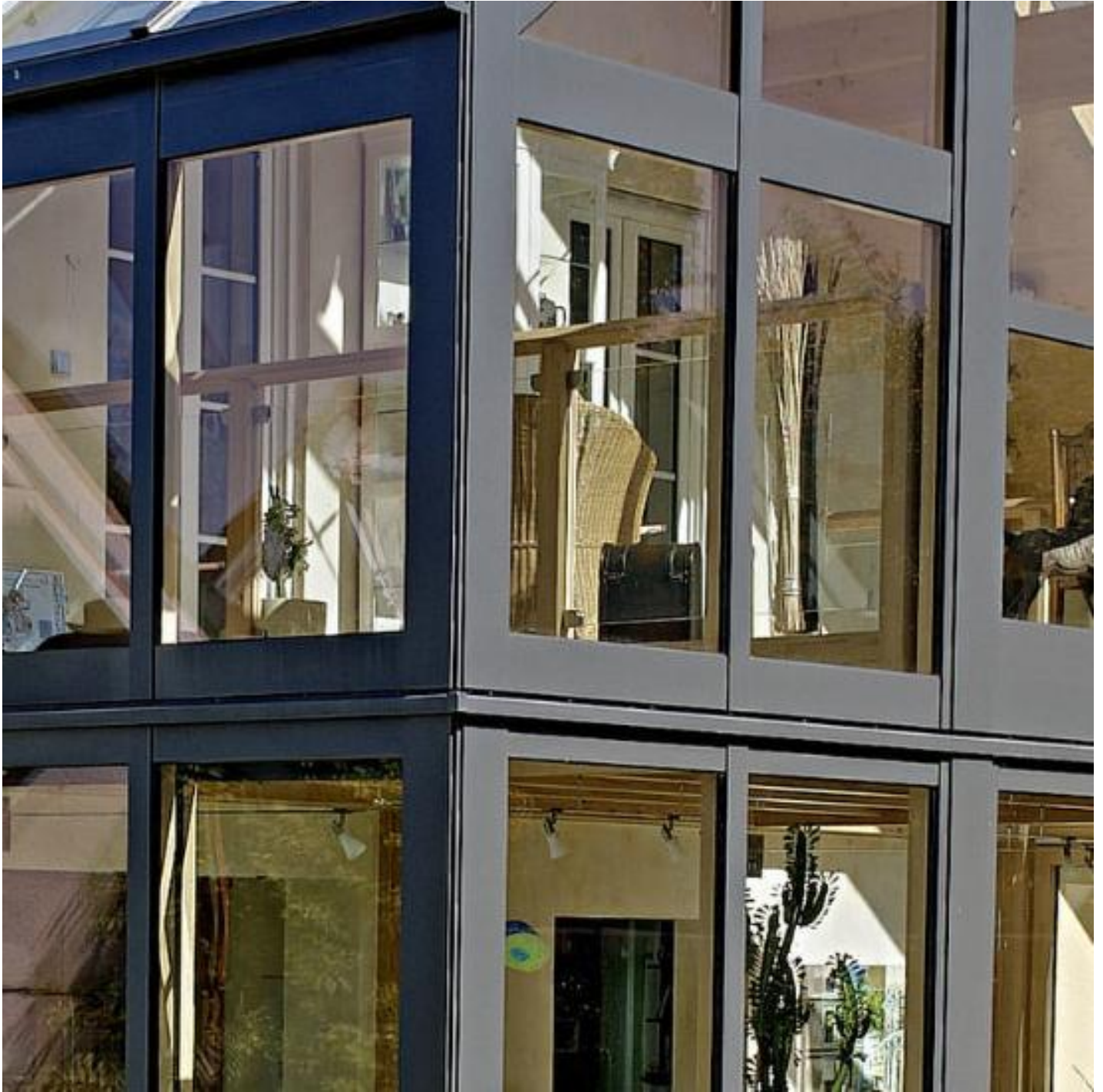
SGG BIOCLEAN® Azura+