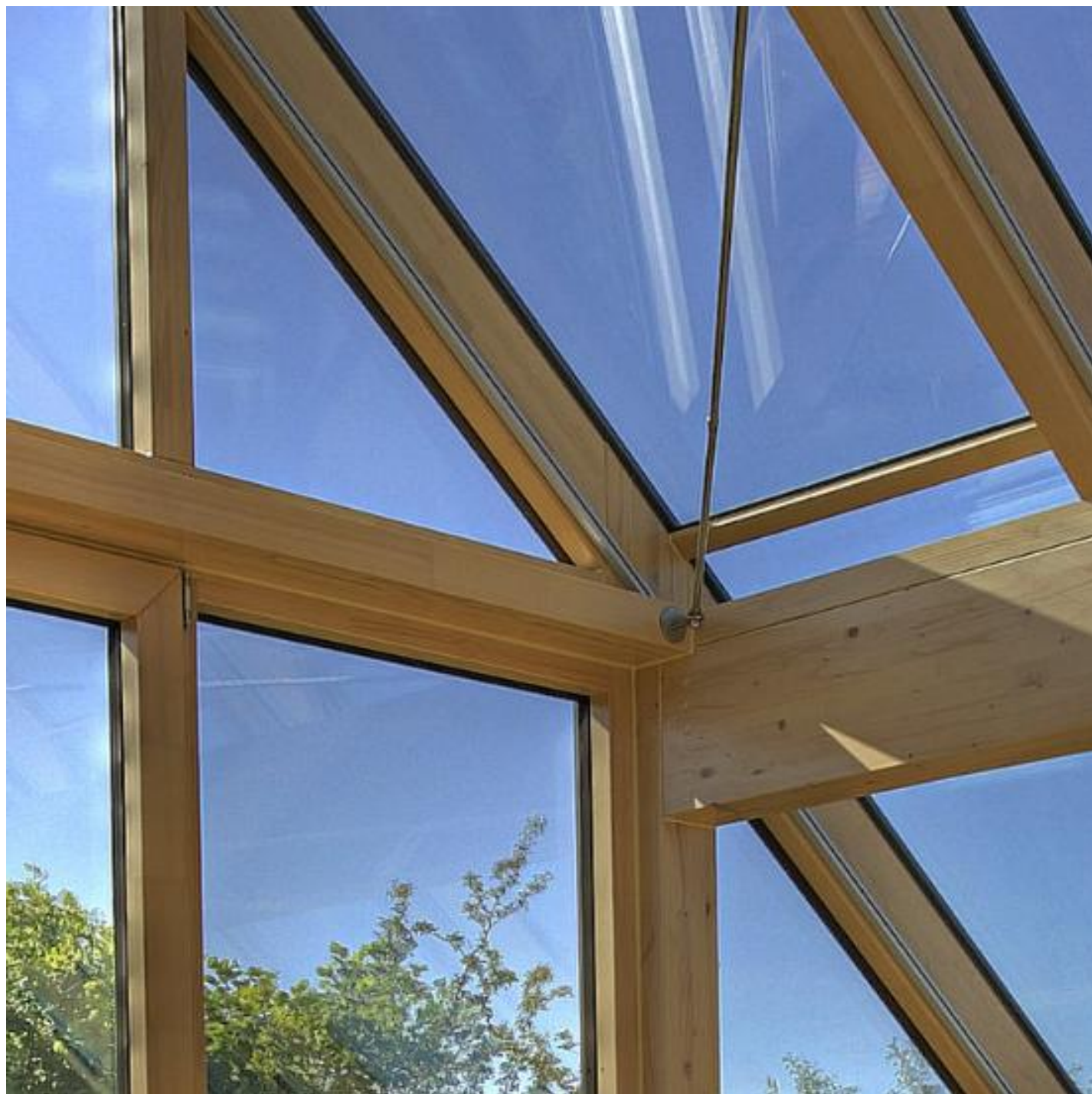
SGG BIOCLEAN® Azura