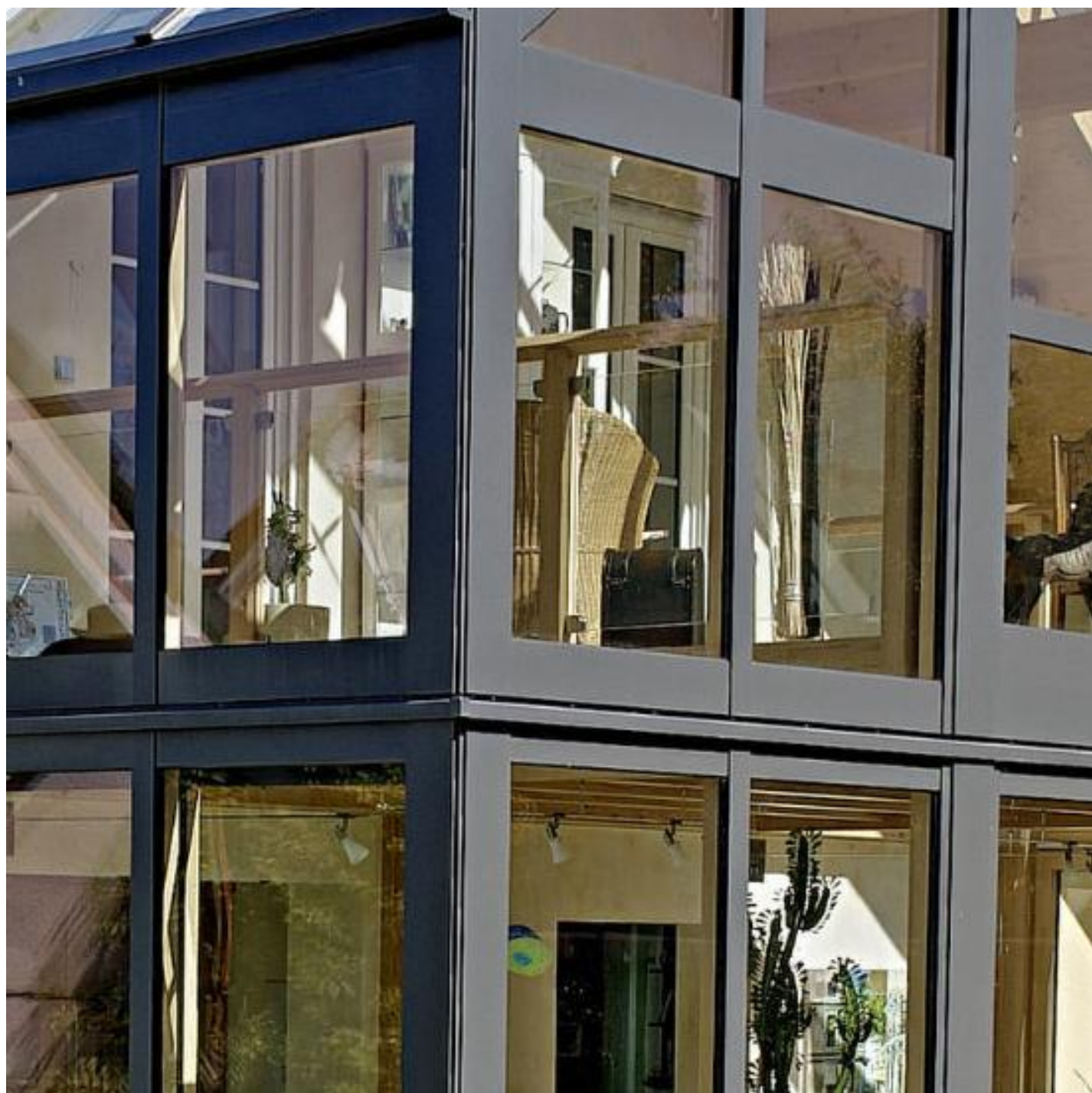
SGG BIOCLEAN® Azura+