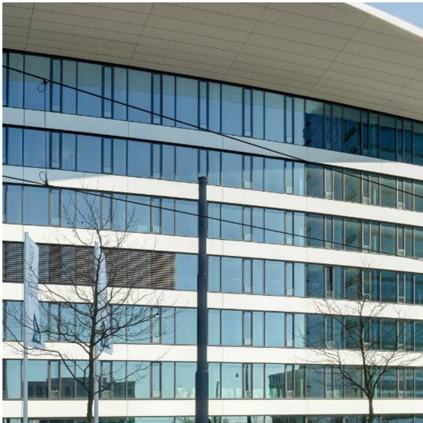
SGG COOL-LITE® SKN 176 / 176 II